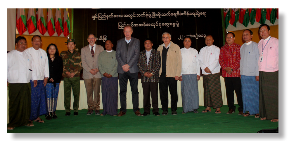
Launching Workshop, November 2013 (Chin State Chief Minister, Ministers, CNF Joint General Secretary, MIID & UNICEF teams)