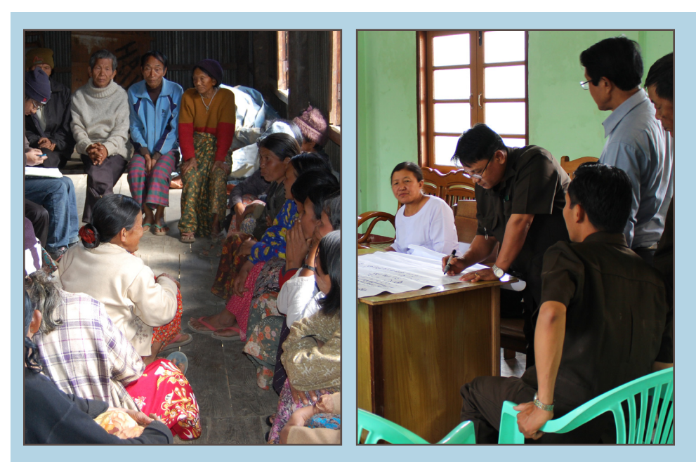
Community consultation in Falam

This inclusive approach to planning and setting priorities has been kept at the forefront of the work process for the Comprehensive Development Plan. As such, the planning process and the resulting plan can be seen as a contribution to the ongoing peace process in Myanmar, presenting a practical model that may be applicable in other conflict affected and ethnic minority areas.